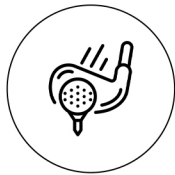
AROUND THE GREEN